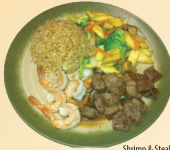
Shrimp & Steak